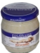
Chrzan - Horseradish Polonaise $2.99

Polish sauerkraut stew. Homemade - ready to eat. [Product Details...]